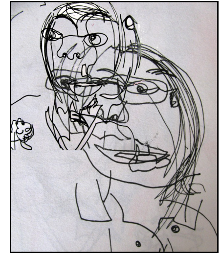
Year 9. Pen drawing. Exploring line and mark making using opposite hand. Taking risks and challenging the recording process