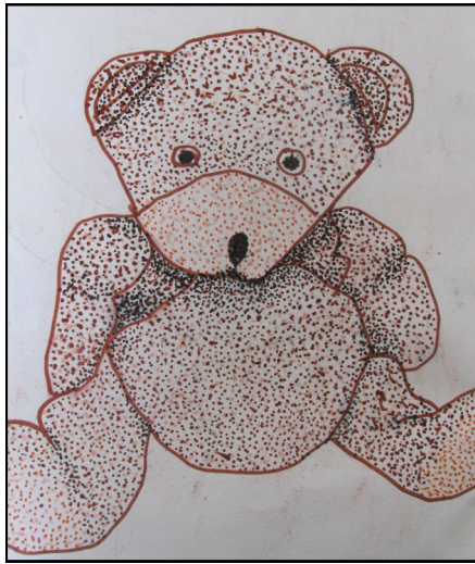
Year 7. Pen drawing. Good shape and application of media. Mark making using pen highlights texture and