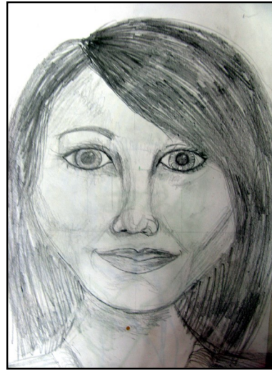
Year 9. Pencil drawing. Accurate proportions and well observed features. Subtle application of tone used to create form